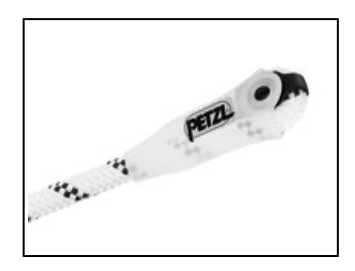
GRILLON lanyards are sold without connectors, so that they can be combined with any type of connector, depending on the user's requirements.

The GRILLON adjustable lanyard is used to make work positioning systems, to complement a fall-arrest system. Its length can be very easily and precisely adjusted as necessary for comfortable positioning at the work station. Depending on the configuration, it can be used in single or double mode. GRILLON is available in seven lengths (2, 3, 4, 5, 10, 15 and 20 m), and also in black. It is certified to North American, European and Russian standards.